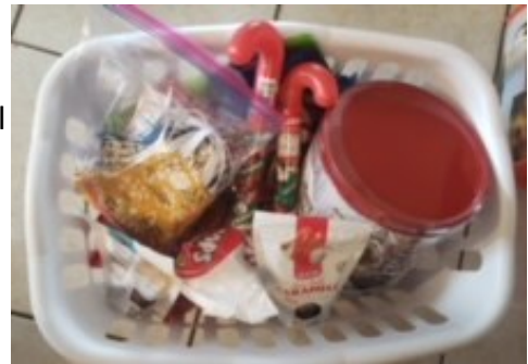
Above: Candy brought to share with the Y2Y students