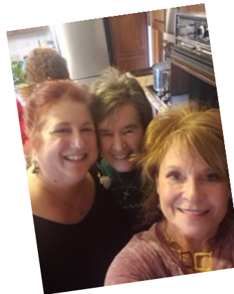
One more of the December gathering of DKG sisters and friends: Just look at those smiles!